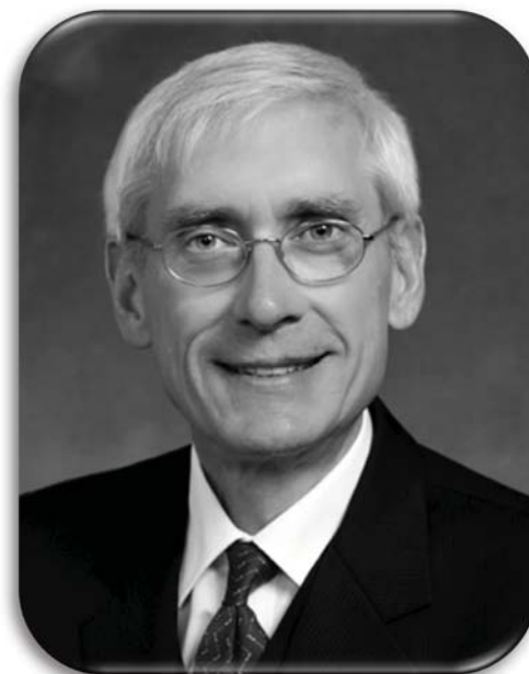
Tony Evers, PhD State Superintendent

The standards within this resource will strengthen CTE's multiple pathways for students to become college and career ready while still in high school. We need to ensure students are exposed to a variety of career development experiences from kindergarten through 12th grade. By adopting the standards within this resource, technology and engineering programs will continue offering relevant, rigorous and authentic learning experiences that meet the students' needs and future ambitions. Career and Technical Education should be part of any comprehensive effort to improve student achievement and success while preparing college and career ready graduates. This continued commitment has great economic implications for our future!