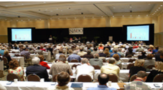
Participants view the results in real time.

Meanwhile, 51 percent strongly agreed and 39 percent moderately agreed that the attraction of the baby boomer generation is a viable development strategy. Interestingly enough, rural leaders still view agriculture-related production and industry as an important part of their future. More than 60 percent believe agriculture is still a viable economic option for their region, with another 27 percent giving it moderate support.