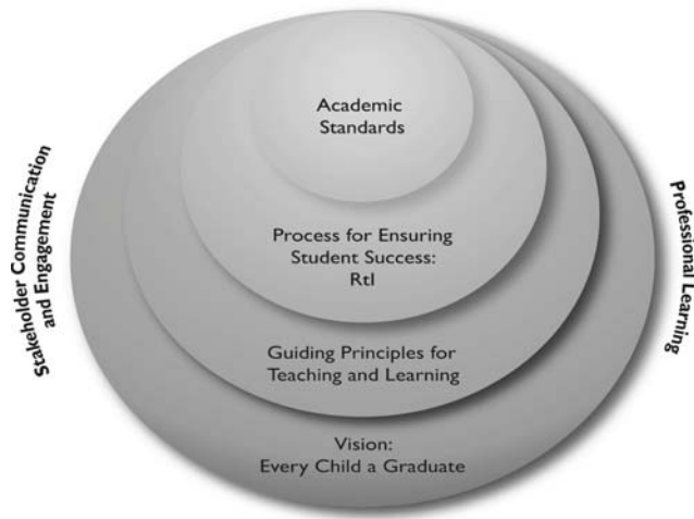
Relationship Between Vision, Principles, Process, Content

To build and sustain schools that support every student in achieving success, educators must work together with families, community members and business partners to connect the most promising practices in the most meaningful contexts. Currently, major statewide initiatives focus on high school graduation, Response to Intervention (RtI) and the Common Core State Standards for English Language Arts, Disciplinary Literacy and Mathematics . Now the release of the Wisconsin Standards for Career and Technical Education brings to light another set of important academic standards for school districts to implement. While these initiatives are often viewed as separate efforts, each of them is connected to a larger vision of every child graduating college and career ready. The graphic below illustrates how these initiatives function together for a common purpose. Here, the vision and set of guiding principles form the foundation for building a supportive process for teaching and learning rigorous and relevant content. The following sections articulate this integrated approach to increasing student success in Wisconsin schools and communities.